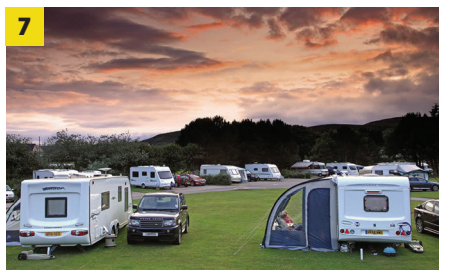
78 August 2022 www.practicalmotorhome.com