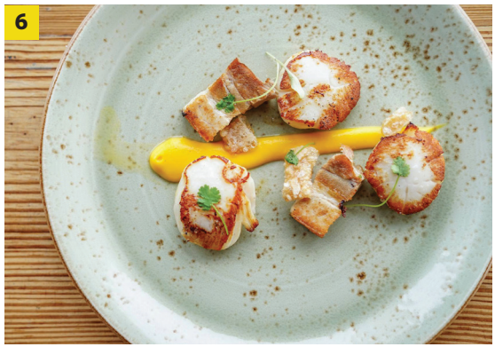
www.practicalmotorhome.com | August 2022 77