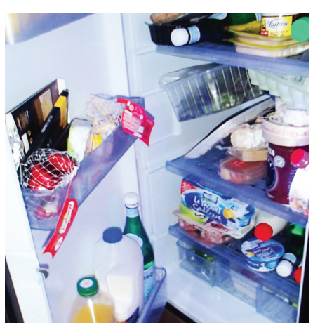
TOP LEFT You can tell a lot about a person from their fridge! ABOVE With a little bit of planning, you'll be able to make best use of your fridge while out on tour

Keep hard-stalked herbs fresh by wrapping them in a single layer of damp paper towel and placing in a resealable plastic bag, before refrigerating. Fruit and vegetables should always be washed before eating, but shouldn't be left wet when stored, because this will promote early deterioration. Potatoes and onions should be kept in a cool, dry environment, not in the fridge.